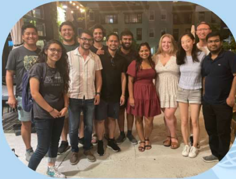
Department of Mechanical

Interface between the graduate students, administration, and faculty of the Mechanical Engineering department and to act in the best interest of the graduate students.